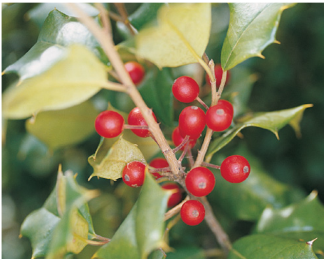
The Druids believed that holly, with its shiny leaves and red berries stayed green to keep the earth

beautiful when the sacred oak lost its leaves. They wore sprigs of holly in their hair when they went into the forest to watch their priests cut the sacred mistletoe.